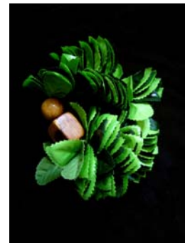
Frilly by Lily