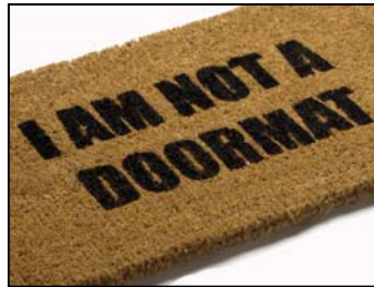
Product of Your Environment