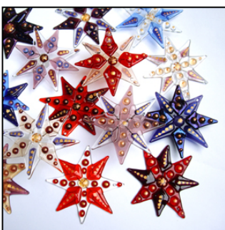
Alex R: Glass Art